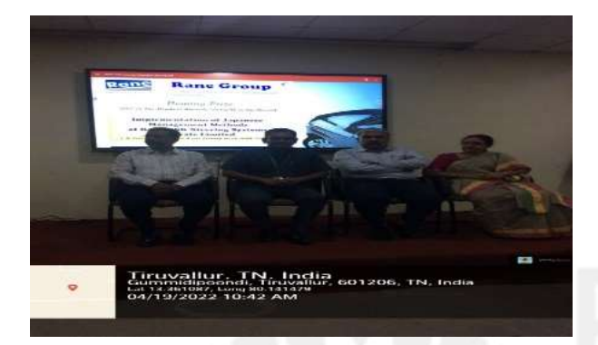
R.M.K. Group of Institutions organized a seminar on 'Importance of learning Japanese Language' and 'Implementation of Japanese Management Techniques ' on 19th April 2022.